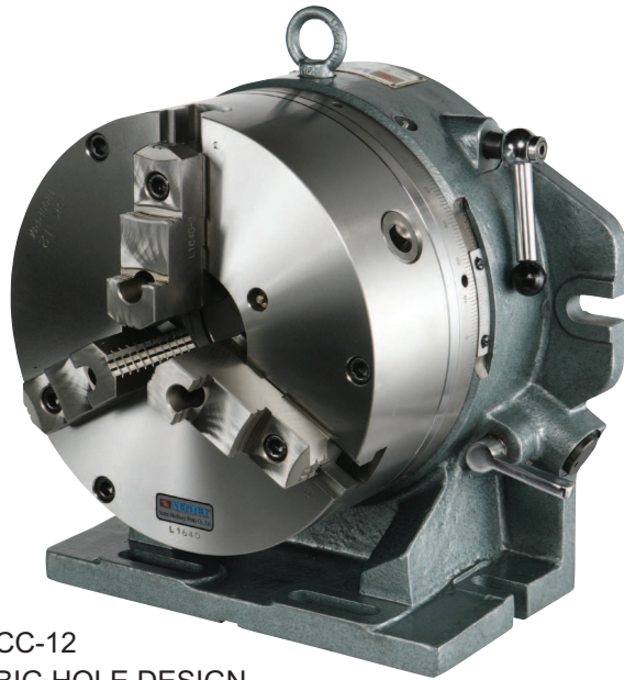
CC-12 BIG HOLE DESIGN