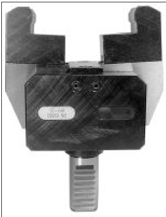
( https://www.kfh-hermann.de/shop/shop/images/product_images/original_images/bilder_B47-SGF_1.jpg?XTCsid=n7eemf1jolajl8itk84fees403 )